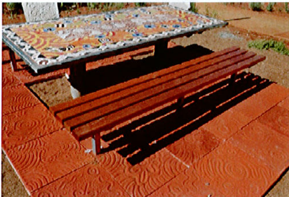
Cover photo by Stewart Roper is a close up shot of the tabletop from this table and paving tiles set which was designed and done by Amata school students, under the guidance of visiting ceramicist Gus Clutterbuck from Adelaide.